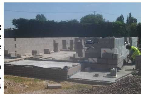
Building work on the new Pavilion is underway!