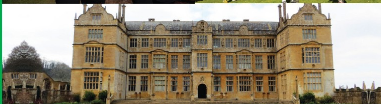
Yeovil Montacute parkrun starting September 2013